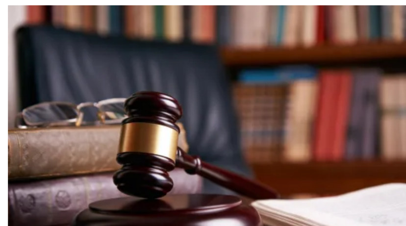
Endorsement: Judge Ami Sagel for Orange County Superior Court Office No. 41