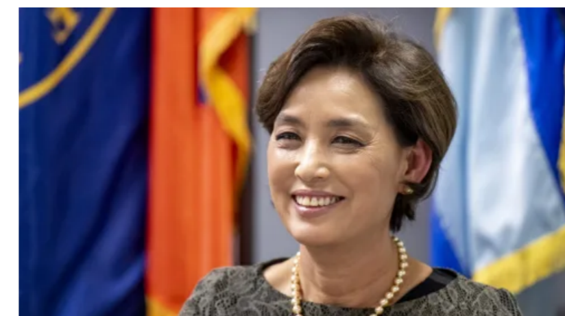
Endorsement: Young Kim for Congress in the 40th District